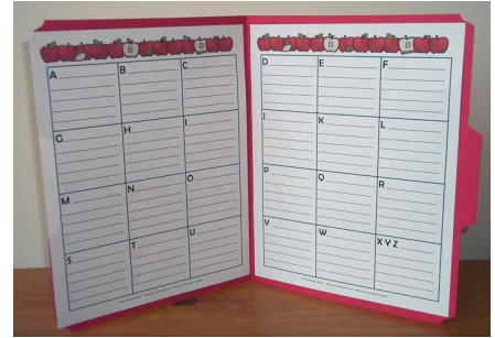
Portable Word Walls for Students